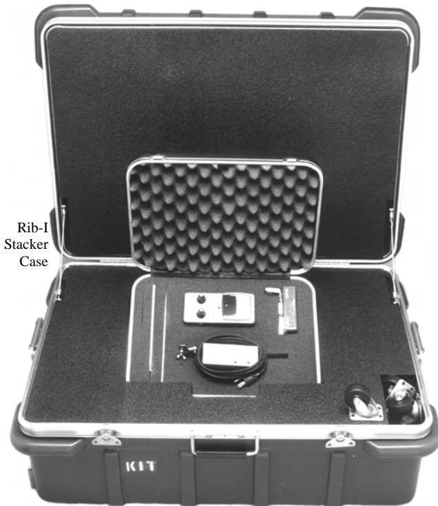
Rib-I Stacker Case

THIS QUALITY CONTROL KIT GIVES YOU THE ABILITY TO MEASURE THE ROUGHNESS OF I.D. AND O.D. SURFACES OF NEWLY DRILLED TAPER LOCK AND STRAIGHT HOLES. THE ROUGHOMETER ALSO INSPECTS AND MEASURES FLAT SURFACES BEFORE ACTUAL DRILLING OF AIRCRAFT OR WORKPIECE.