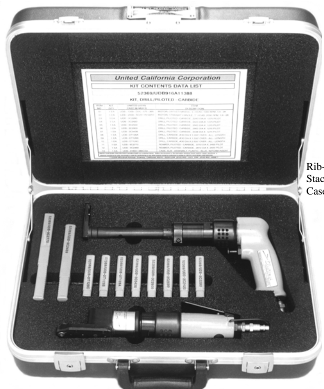
Rib-I Stacker Case

This Carbide Cutting Tool Kit contains straight and offset high speed Pneumatic Air Drill Motors, eight encased Piloted Carbide Drills and two encased Carbide Reamers. Shockproof Rib-I Stack Case UDB-916A11388-13 is 18" H x 13" W x 5" H with foam inserts.