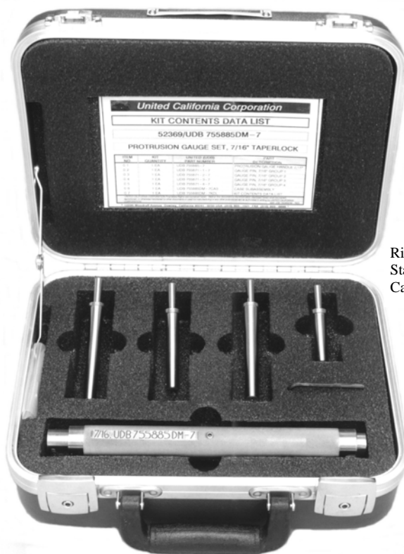
Rib-I Stacker Case

UTK-755885DM-7 KIT METRIC * UTK-755884 KIT INCH STANDARD